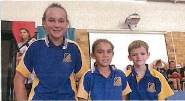
Primary Buddy Ticket Winners