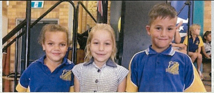
Infant Buddy Ticket Winners