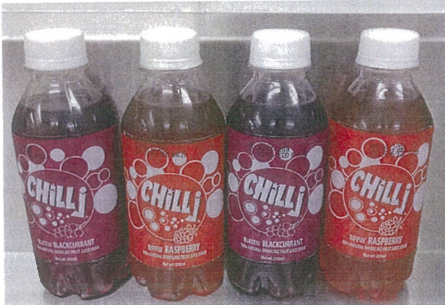
CHILL JUICE $2.50