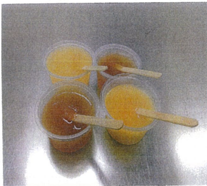
FROZEN JUICE CUPS $1.00