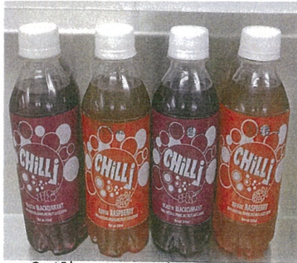
CHILL JUICE $2.50